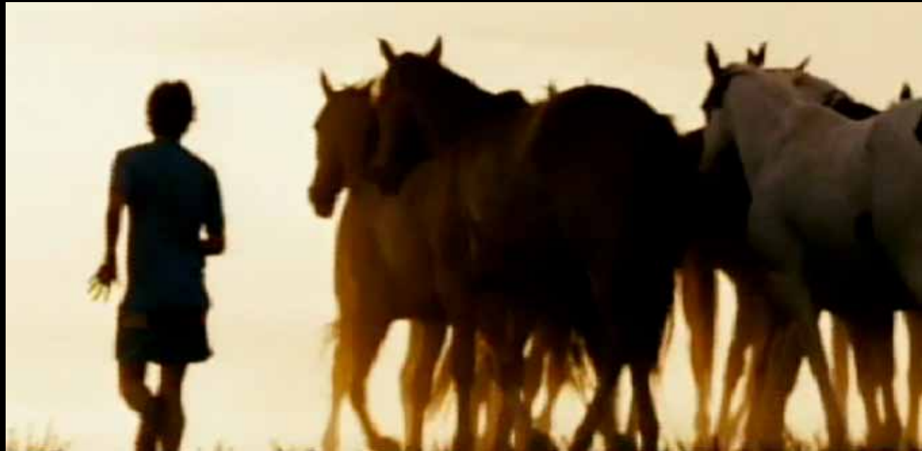
PLACE AS CHARACTER