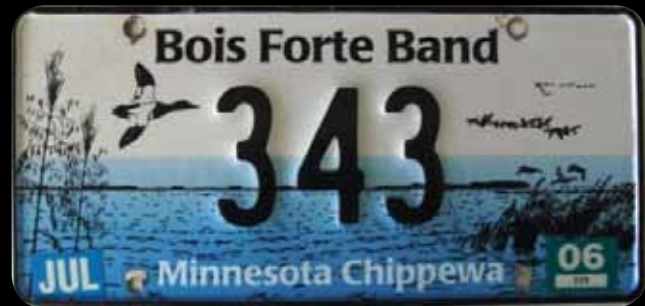
PLACE AS CHARACTER