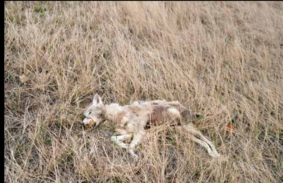
NATURE AS CHARACTER