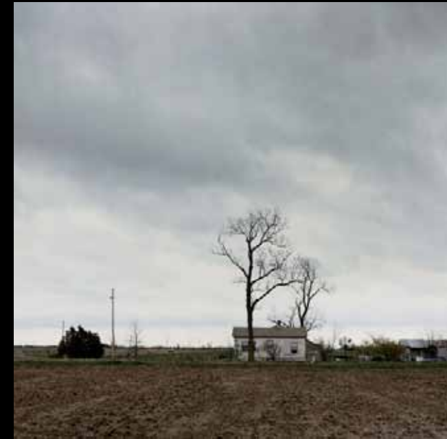
MINDSCAPE AS CHARACTER