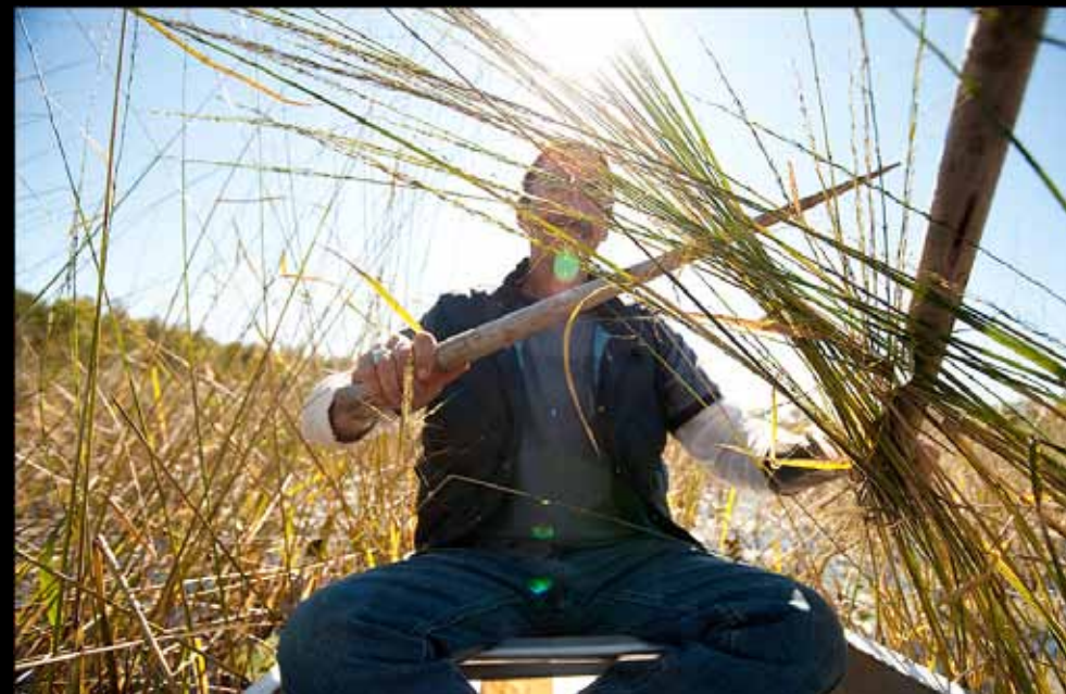
MINDSCAPE AS CHARACTER