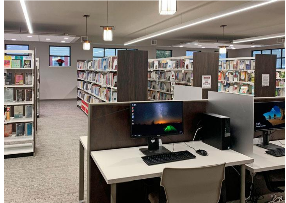
Kimball Public Library, 2019 grantee