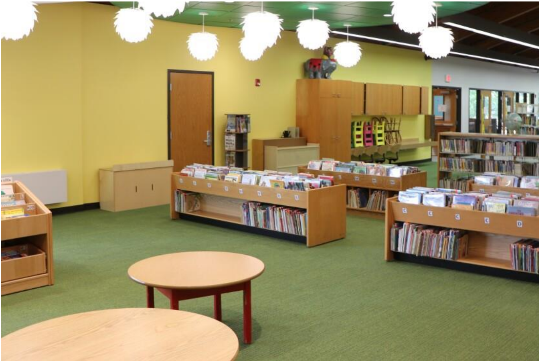
Cloquet Public Library, 2019 grantee