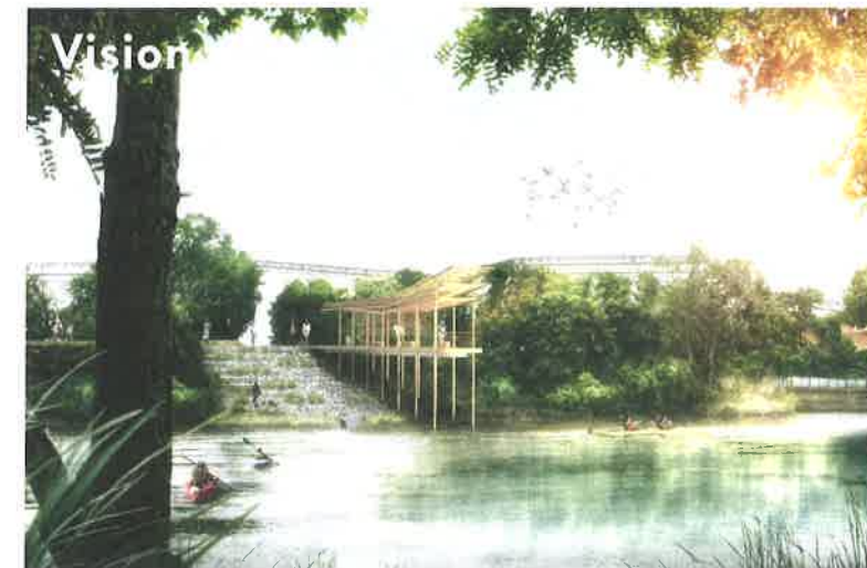
Overlook at 26th Avenue North and Mississippi River Shoreline