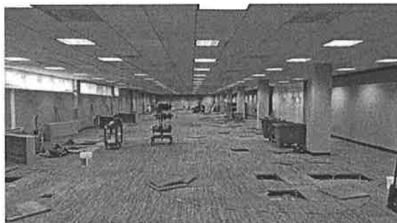
An MNIT office currently under renovation.