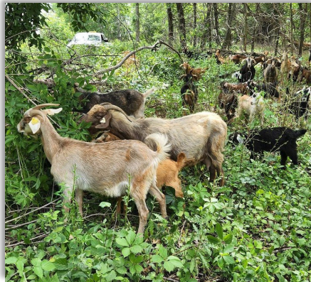
Top: Goats munch on invasive buckthorn at OHF sites in Washington County, Minnesota