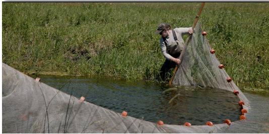
Sampling fish populations on the Northern Tallgrass Prairie Wildlife Refuge