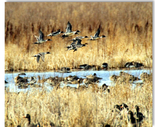
Lake Christina Waterfowl Production Area, Douglas County