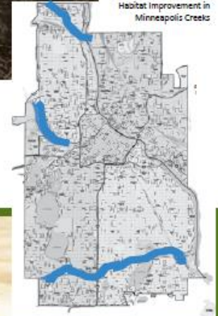
Green Infrastructure and Habitat Improvement in Minneapolis Creeks