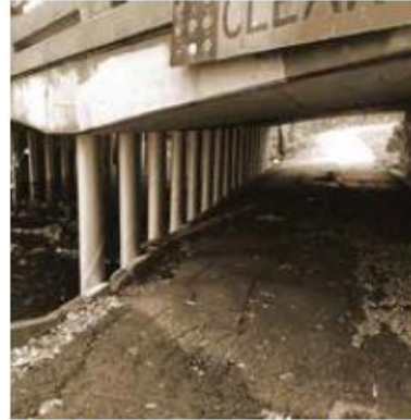
wall, pavement, bridge failures