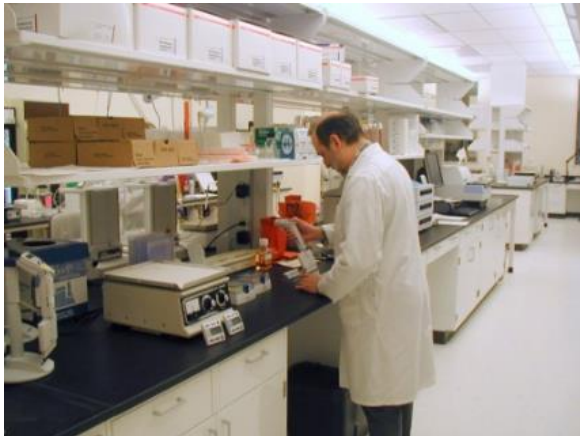
MDH scientists require sophisticated lab equipment to perform rapid detection and identification of public health threats that protect the health of the public.

The laboratory facility shared by the departments of Health and Agriculture was completed in 2005. Equipment purchased at the time of construction or brought from the previous location is at or near the end of its projected service life.