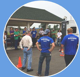
NECHAMA Volunteer Clean-Up Day, Wadena, MN