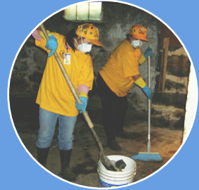
MN-WI Baptist Convention volunteers