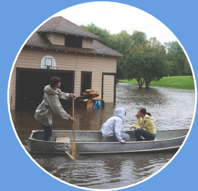
Lyon County flooding