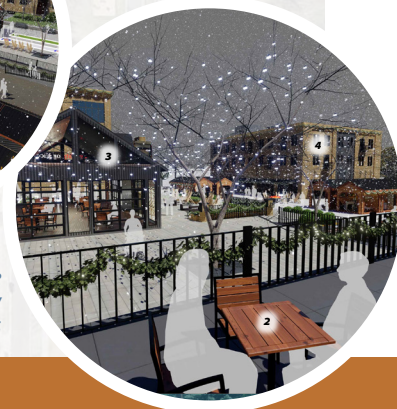
Views of the planned new public spaces