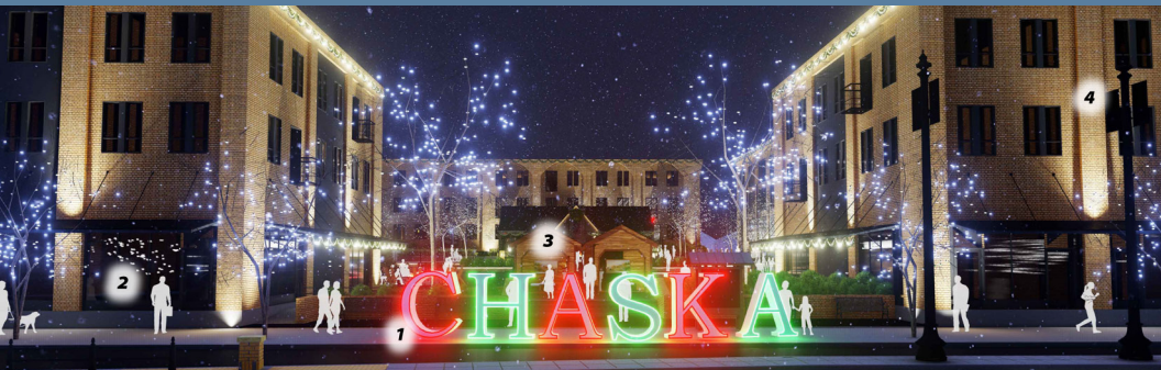
3D View of new public space from MN Highway 41

“The City Square West Redevelopment Project will be a major public gathering space and pedestrian connection that builds upon Chaska's legacy of investing in successful downtown improvements. ”