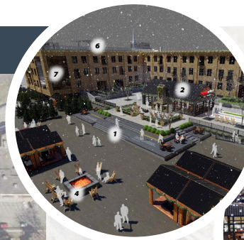
City Square West Redevelopment Concept