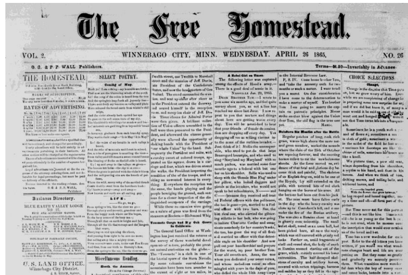
The Free Homestead (Winnebago, MN), April 26, 1865