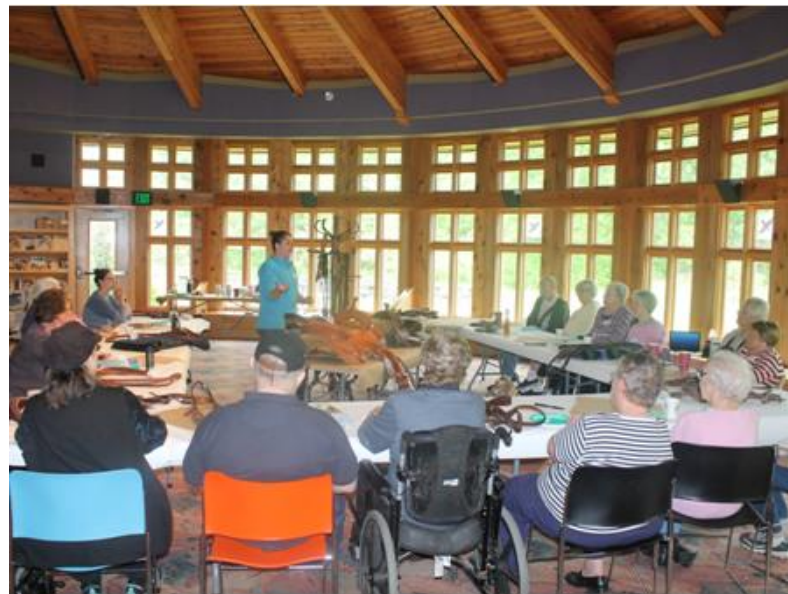
People living with memory loss and their care partners participate in a program at the Snake River Fur Post.