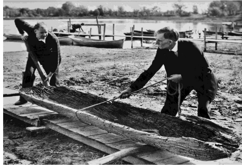
Dugout canoe pulled from Lake Minnetonka, 1934.