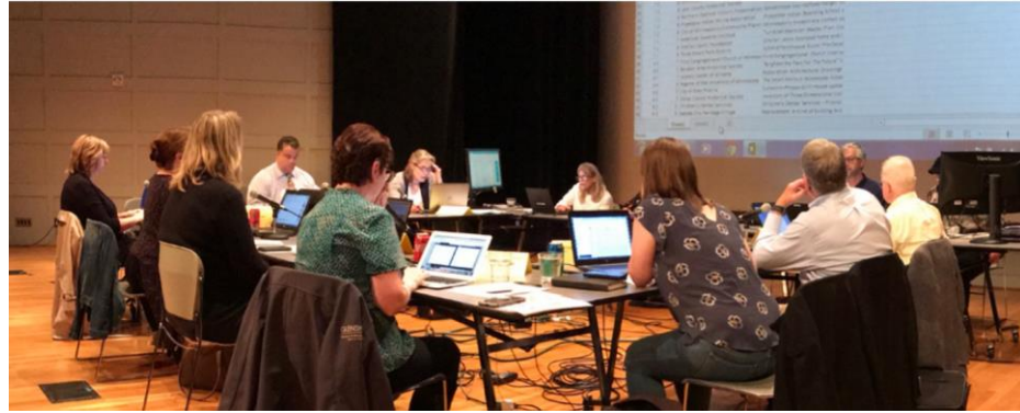
HRAC meeting, Sept. 2018