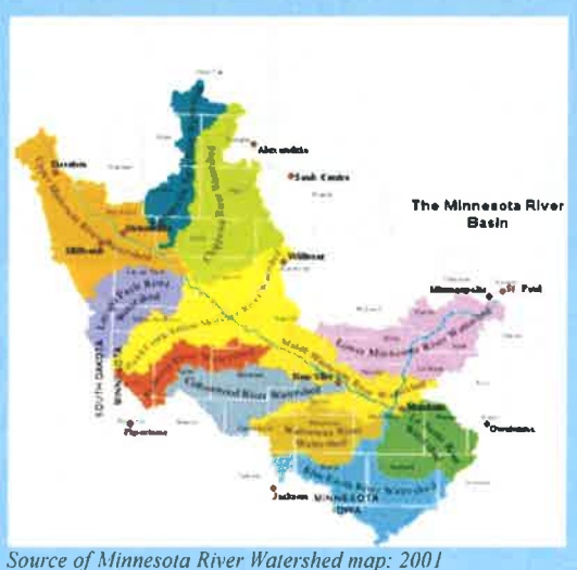
Source of Minnesota River Watershed map: 2001 Minnesota River Basin Plan by the Minnesota Pollution Control Agency.