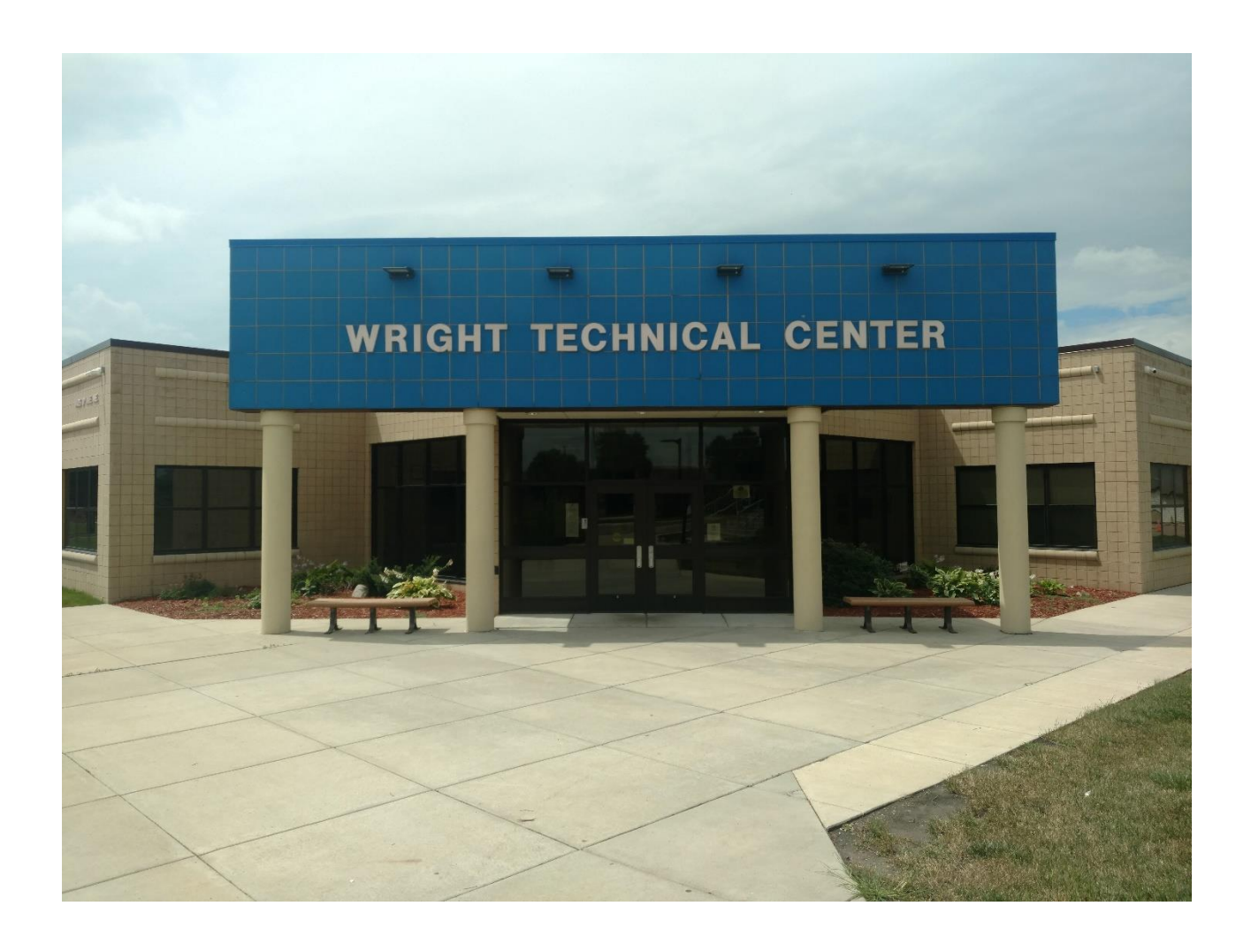
The WRIGHT path for High School