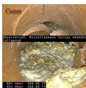
Collapsed sanitary sewer pipe in Flensburg, MN.

The City of Flensburg lacks municipal drinking water infrastructure, relying on individual sand-point wells, which are vulnerable to contamination . The MPCA monitors an active petroleum leak in the area with wells, and while corrective actions to remove contaminated soil are ongoing, full remediation has been challenging due to the spread of the contamination plume. Flensburg's sanitary sewer system, installed in 1950, is made of deteriorating vitrified clay pipes and modular manholes. Televised inspections reveal poor conditions, including sags , cracks , root intrusions , and collapses . In recent years, homeowners continue to experience basement sewer backups .