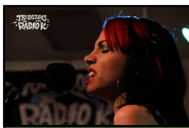
A band performs live from "Studio K" (produced by students) on Radio K