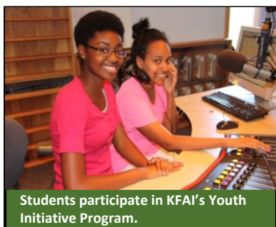
Students participate in KFAI's Youth Initiative Program.