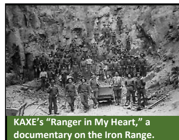
KAXE's "Ranger in My Heart," a documentary on the Iron Range.

There are two types of public radio in Minnesota, the Minnesota Public Radio (MPR) network and the smaller local community radio stations. The smaller grassroots community stations created the Association of Minnesota Public Education Radio Stations (Ampers) in 1972.