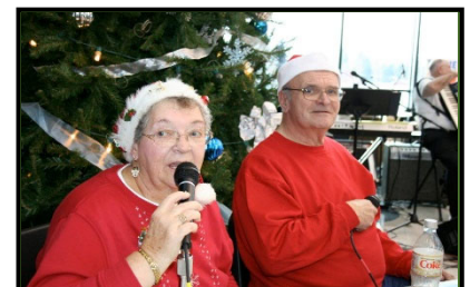
KSRQ's "Saturday Morning Barn Dance"