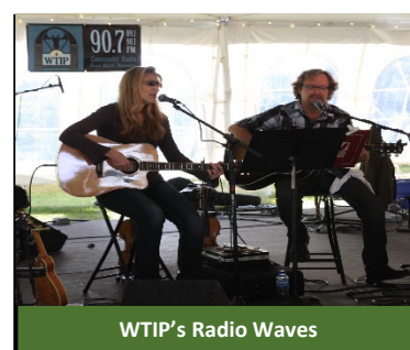
WTIP's Radio Waves

Ampers is not affiliated with nor does it receive funding from Minnesota Public Radio (MPR)