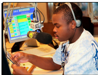
A North High student announcing on KBEM/Jazz88