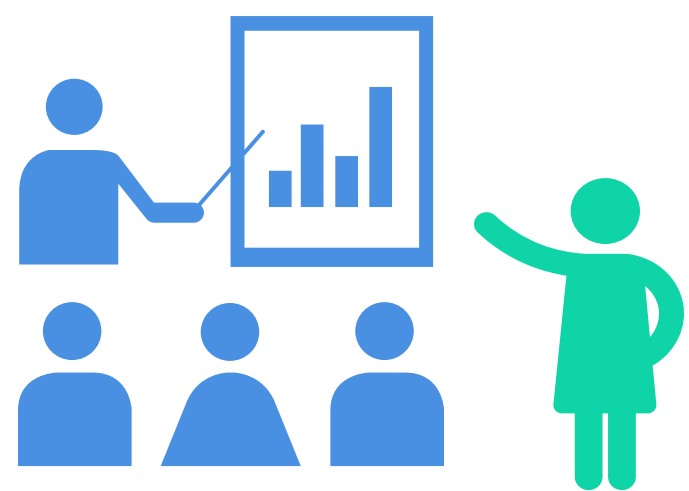
EDUCATION & THERAPY CLASSROOM

The Therapeutic Teaching Model is a two-year pilot program paid for through a Department of Human Services Innovative Mental Health Grant.