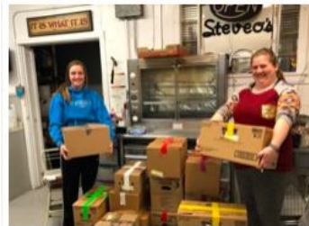
In the back room of Bonnie's Hometown Grocery, volunteers maintain social distance while packing and delivering color-coded meal-kit boxes.