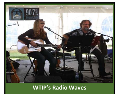
WTIP's Radio Waves

Ampers is not affiliated with nor does it receive funding from Minnesota Public Radio (MPR)