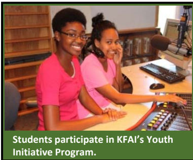
Students participate in KFAI's Youth Initiative Program.

*Note: revenue listed for Ampers is per station.