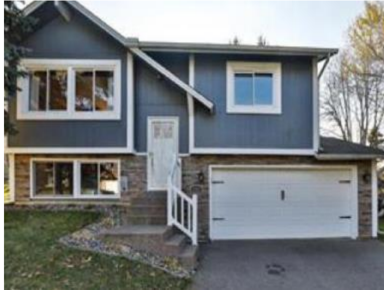
Buy & Rehab