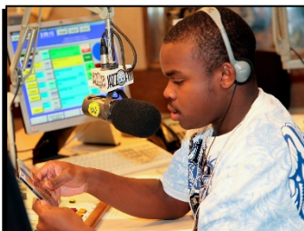
A North High student announcing on KBEM/Jazz88