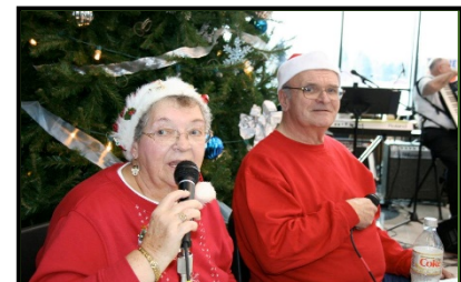
KSRQ's "Saturday Morning Barn Dance"