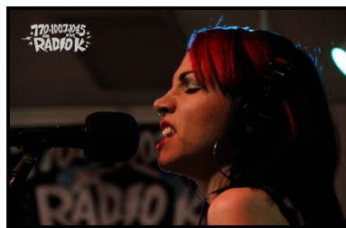
A band performs live from "Studio K" (produced by students) on Radio K