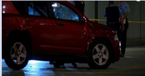
MINNESOTA.CBSLOCAL.COM Minneapolis Police Investigate Shooting, Crash On West Broadway Avenue