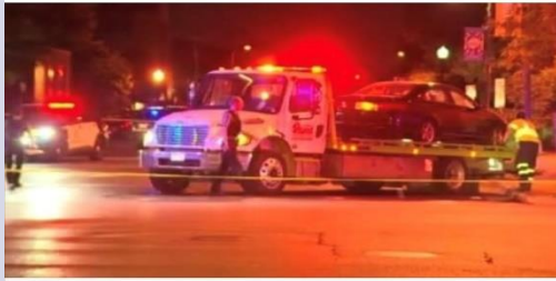
MINNESOTA.CBSLOCAL.COM Minneapolis Police Investigating After Overnight Shooting Leaves 1 Dead