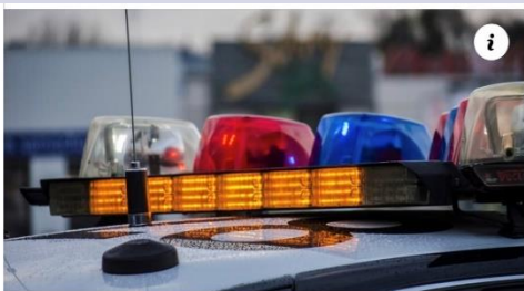
BRINGMETHENEWS.COM 3 stabbed less than 90 minutes apart near downtown Minneapolis