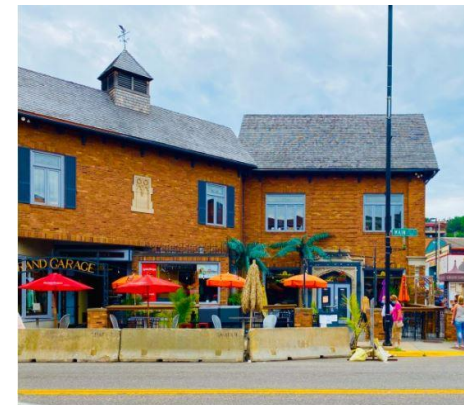
Outdoor Dining in Right-Of-Way