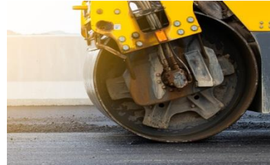
Asphalt Delivery E-Tickets

Our staff implemented over 90 innovations, everything from electronic asphalt delivery tickets to online payments for billboard permits.