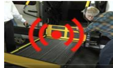
Virtual Inspection of Motor Carriers