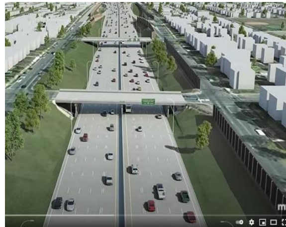
Self-Guided Tour, I-35W@Downtown to Crosstown Project