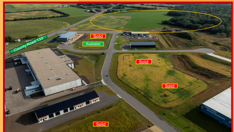
Future planned site.