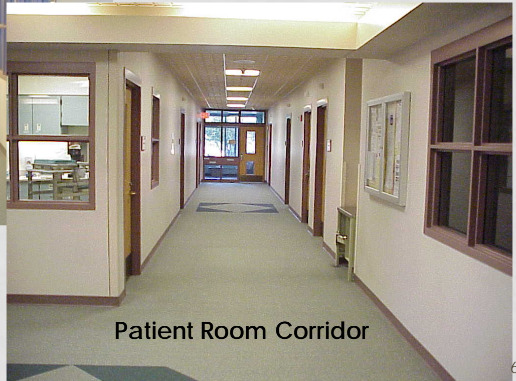
Patient Room Corridor