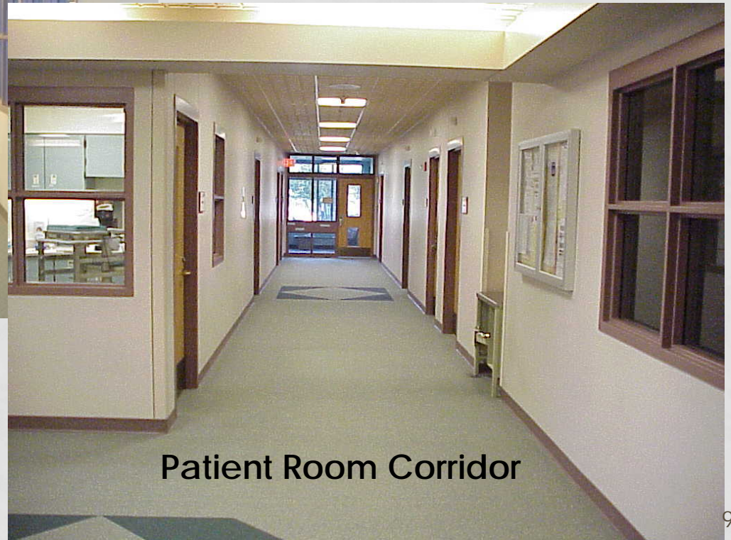
Patient Room Corridor