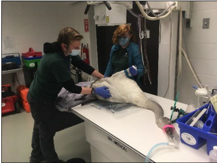
Trumpeter Swan Exam