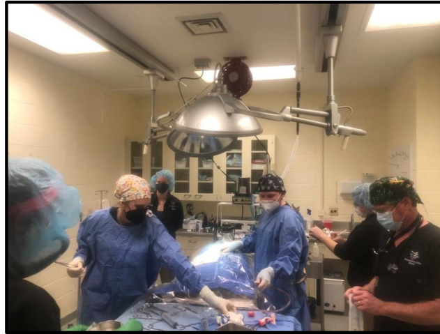
Dated Surgical Suite – in use