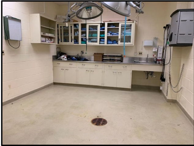
Dated Surgical Suite - empty