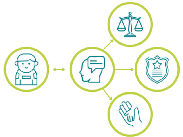
With a trained forensic interviewer