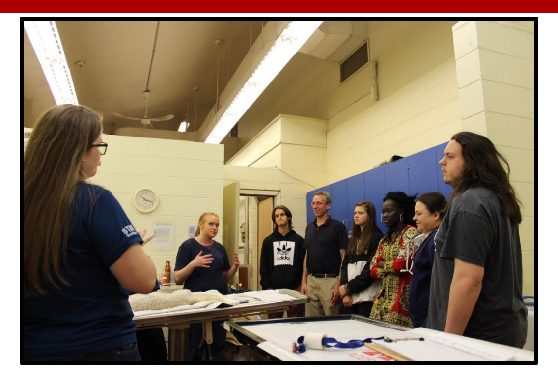
MSAD Educational Programs

Starting at 18 months of age – through 21 years of age.