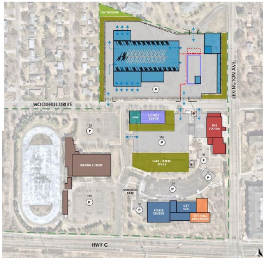
License and Passport Center Concept including parking lot and supporting green space

The City of Roseville, located in Ramsey County, is a first ring suburb of St. Paul and Minneapolis. Roseville is home to 36,254 residents, 15,554 households, and over 34,000 jobs within the community. Roseville shares borders 10 different communities including St. Paul and Minneapolis and has the principal arterials of Hwy. 36 and I-35W corridors as well County Road minor arterials that traverse through the city. As a result of its location and amenities, Roseville is a regional destination for jobs, shopping, and recreation.