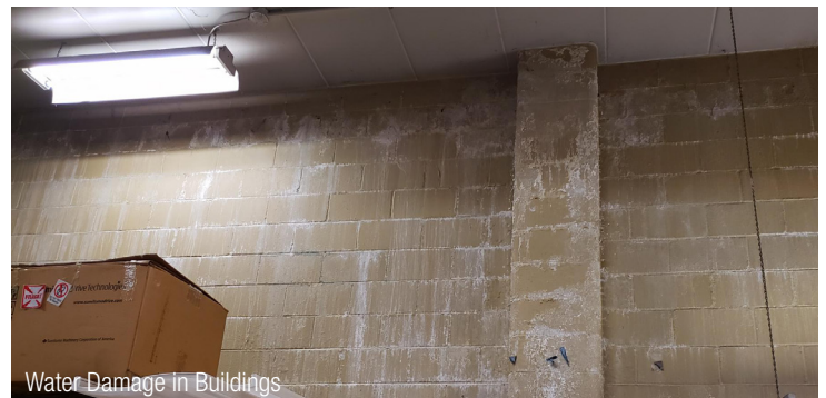
Water Damage in Buildings

A new sanitary district will benefit everyone in our communities.