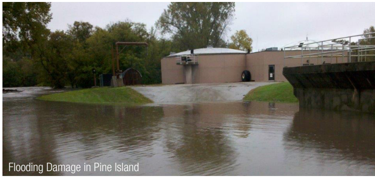
Flooding Damage in Pine Island