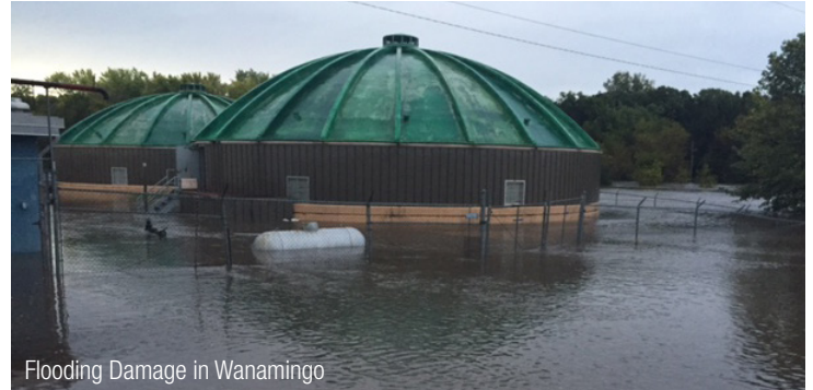
Flooding Damage in Wanamingo