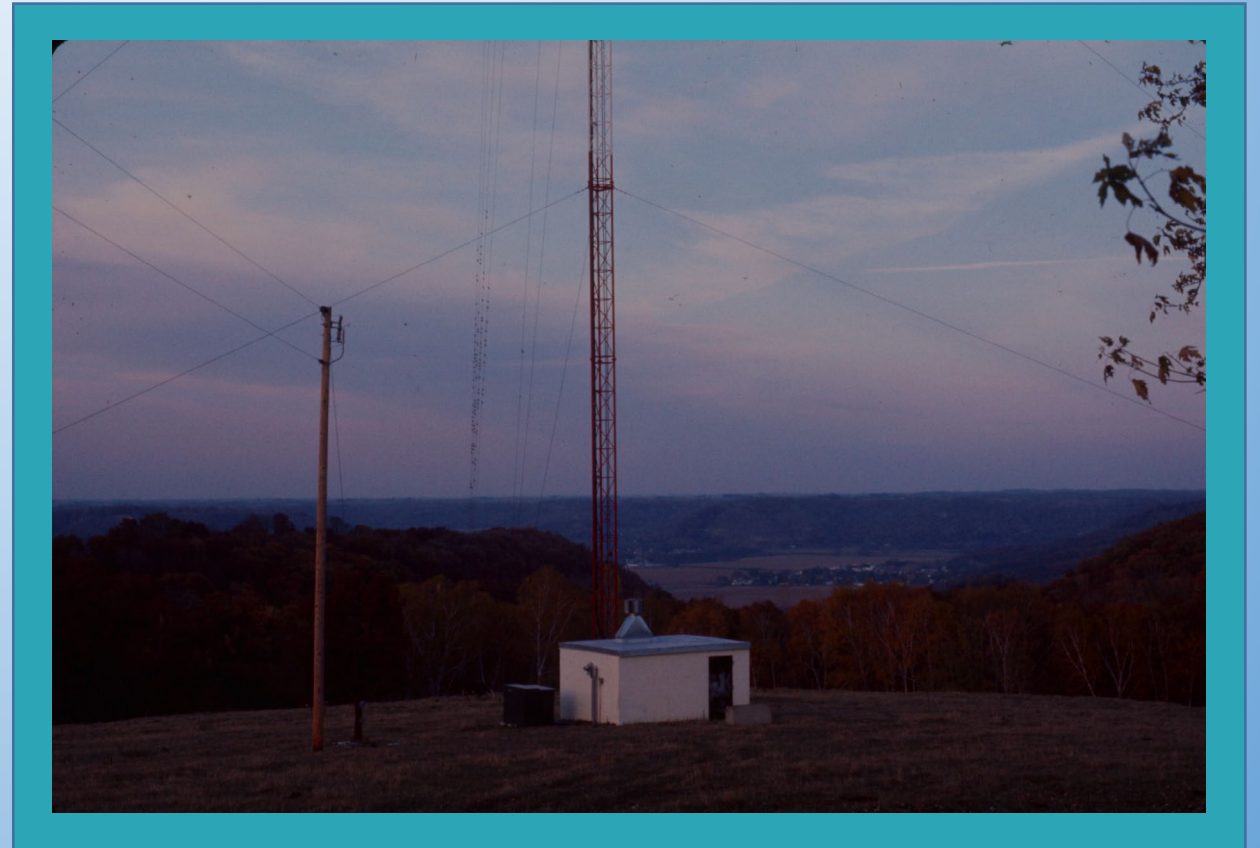
WSCD tower in Duluth