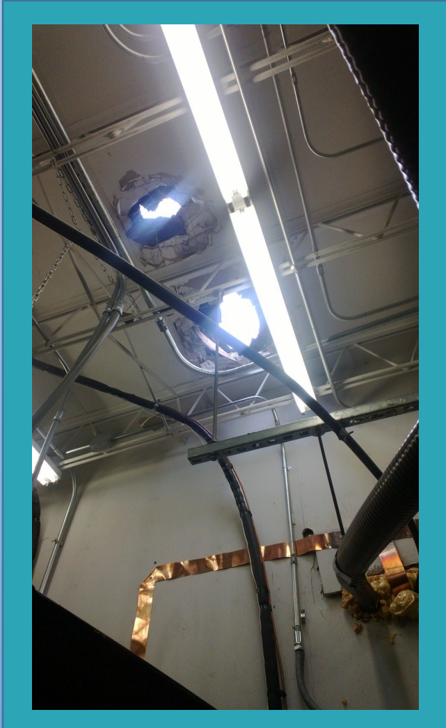
Holes in roof of equipment facilities from icicles