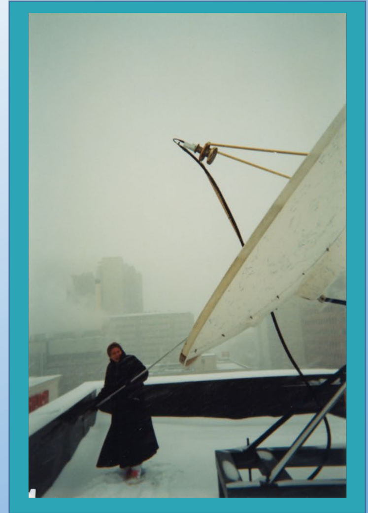
Staff clearing snow from a satellite dish in Rochester.

We always have equipment breaks, whether from extreme weather or just old age.