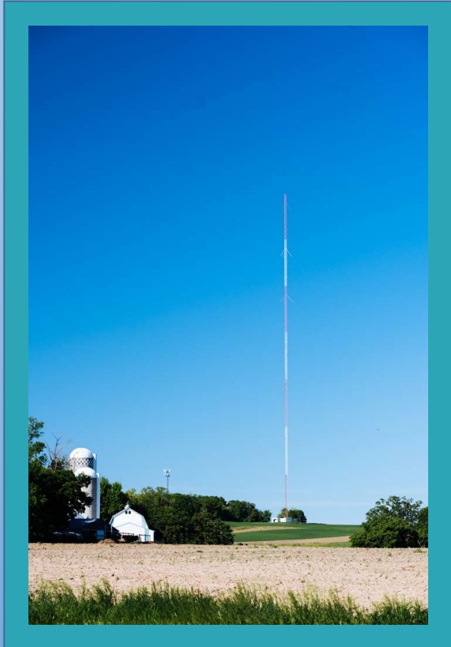
Tower outside Collegeville

MPR does not simply deliver the EAS signal - Its staff works with media partners throughout our state to ensure the system is operating correctly and troubleshooting problems which may arise during tests of the system.