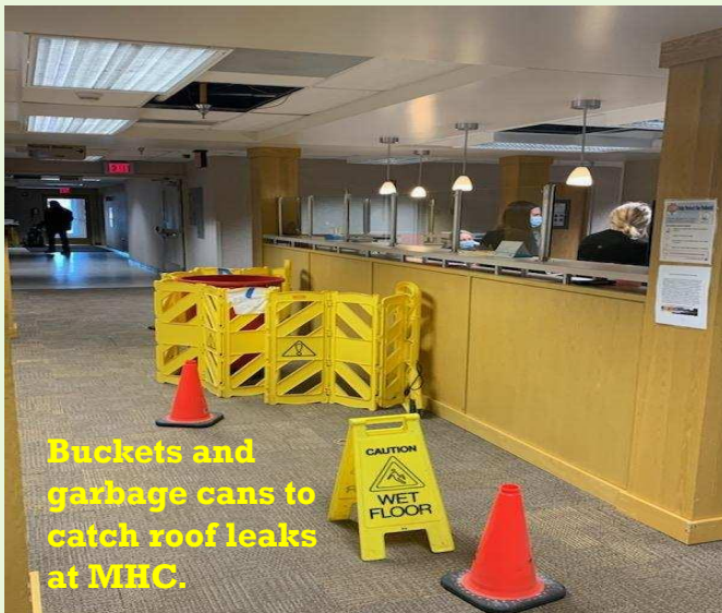
Buckets and garbage cans to catch roof leaks at MHC.