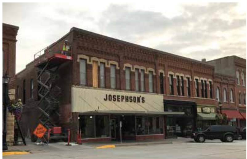
Photo of Red Wing's downtown housing conversion

One current example is Red Wing's Downtown Conversion project, which will convert existing unused space above a local retailer to four 1-bedroom units. The AHTF provided $100,000 for the project, which will ensure that at least two of the four units are restricted at no more than 60% AMI for 15 years. The City has contributed to the project with water and sewer upgrades, and the HRA utilized Small Cities Program income funds for additional construction costs.