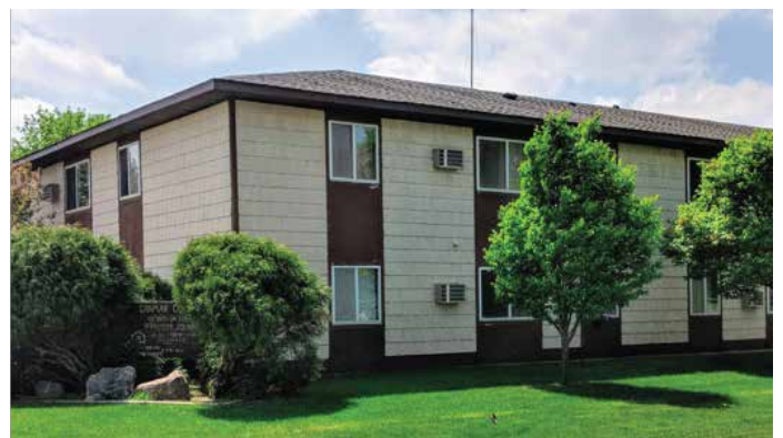
Photo of Gar-Mar Court in Kerkhoven MN

After participation in MHP's Housing Institute, the Swift County RDA, HRA, and the County Administration identified a Local Housing Trust Fund as a way to support Swift County's goal to purchase and preserve Gra-Mar Court, a 16-unit USDA Rural Development 515 building in Kerkhoven. With the support of County Commissioners, they proposed and received approval for a Swift County Local Housing Trust Fund in 2020 and will use the annual funds to support the Gra-Mar Court purchase with remaining funds dedicated to additional preservation and rehab goals.