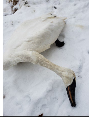
Dead swans found by residents visiting Sucker Channel