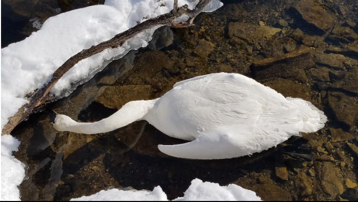
Swans that died at the channel and were brought in for testing