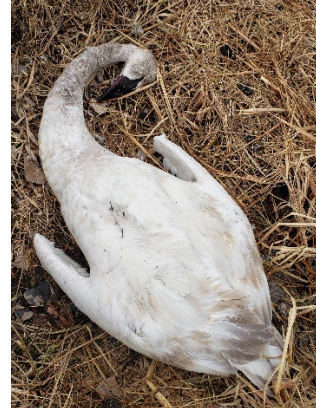
showing a dead juvenile swan in the foreground, and live swans and other waterfowl at the open water of the channel on a cold winter day