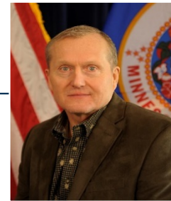
Douglas Hughes Deputy Commissioner Veterans Healthcare