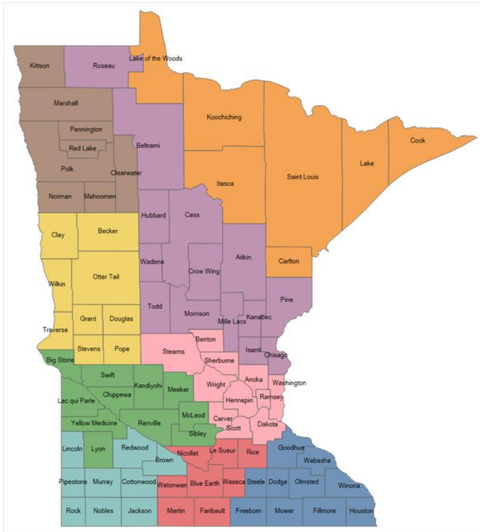
Figure 2 - Map of Rating Areas in Minnesota – 2021