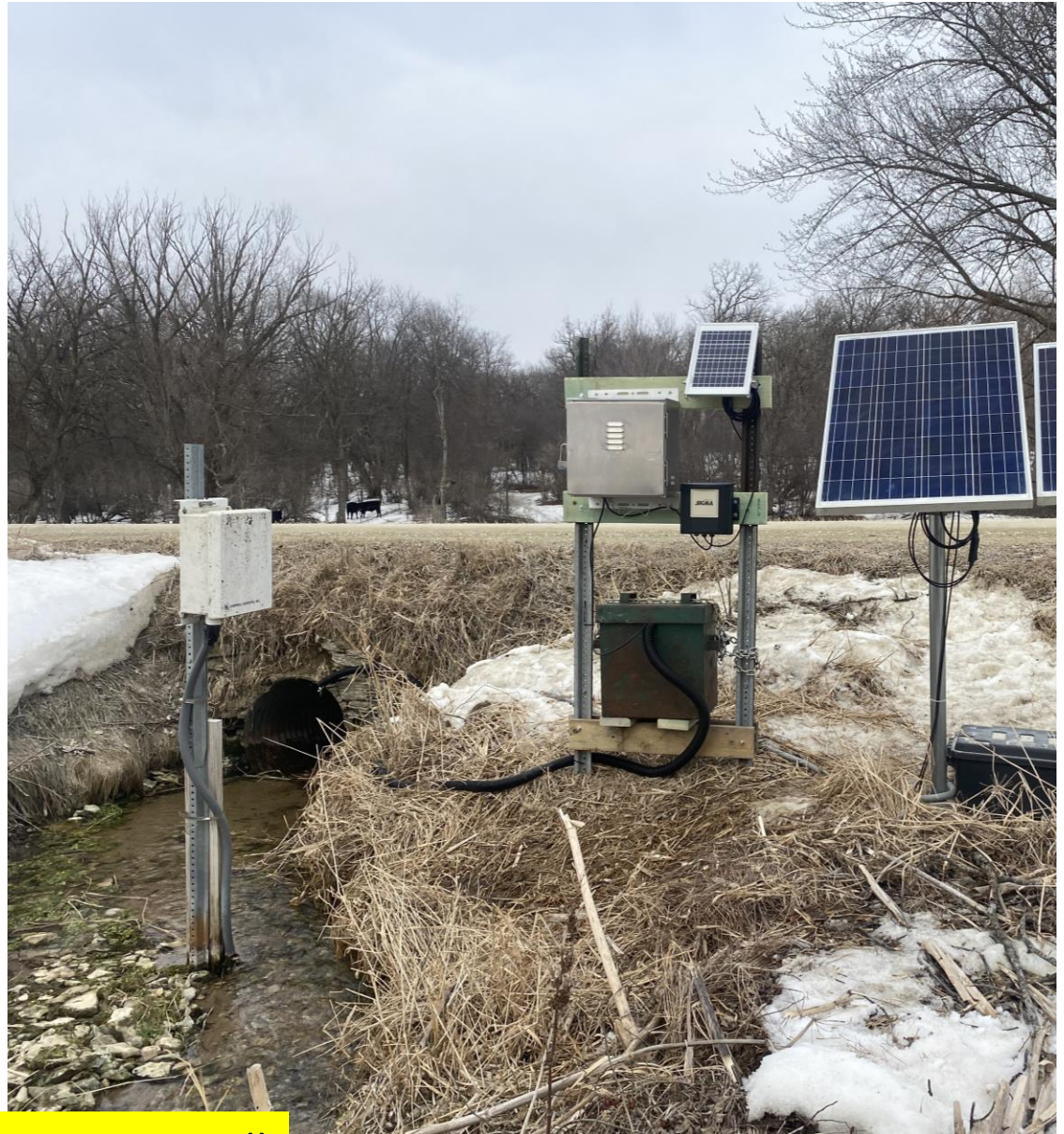
Continuous Spring Monitoring Equipment Install