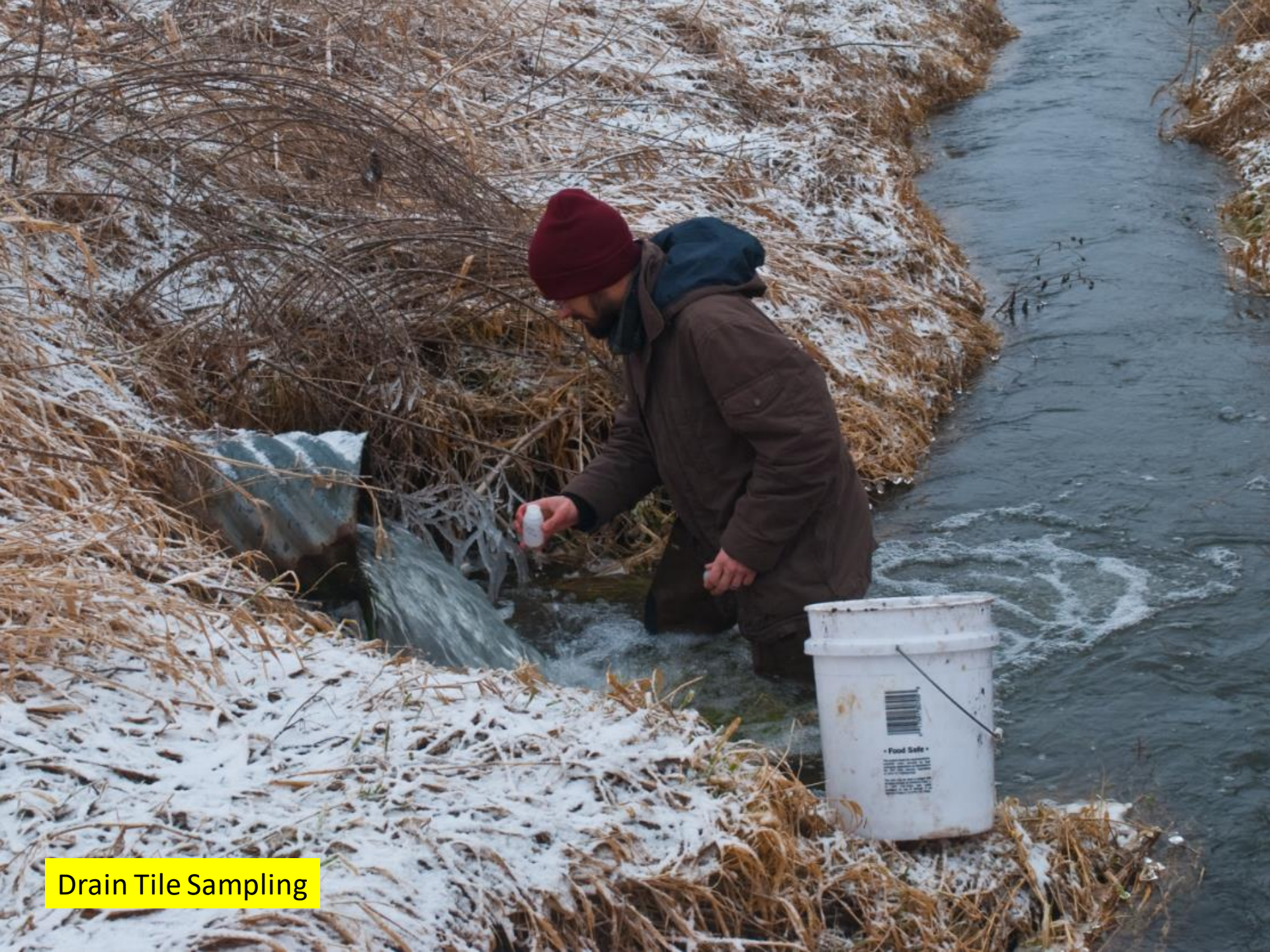
Drain Tile Sampling