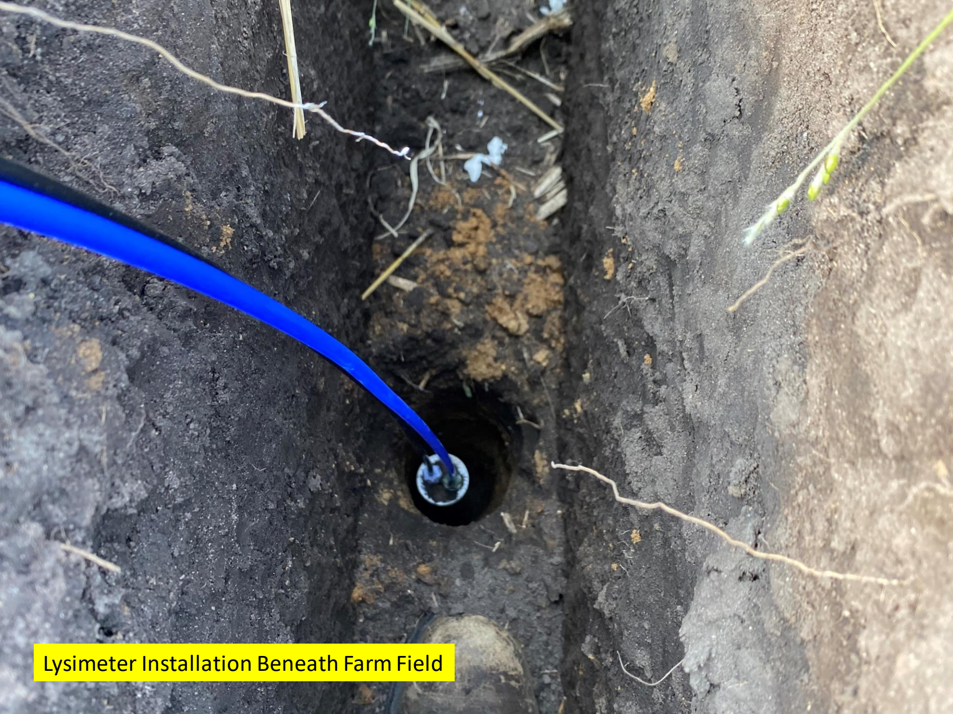
Lysimeter Installation Beneath Farm Field