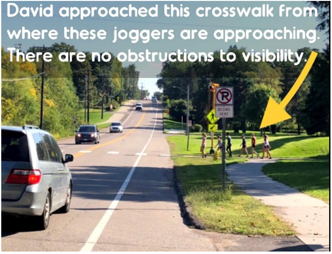
Ramsey County Central Park Crosswalk (Text in image: David approached this crosswalk from where these joggers are approaching. There are no obstructions to visibility)