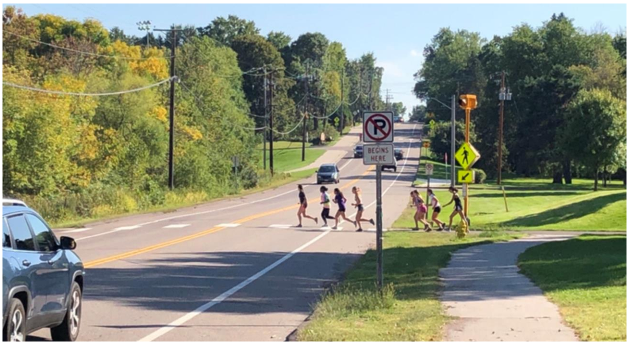
Ramsey County Central Park Crosswalk