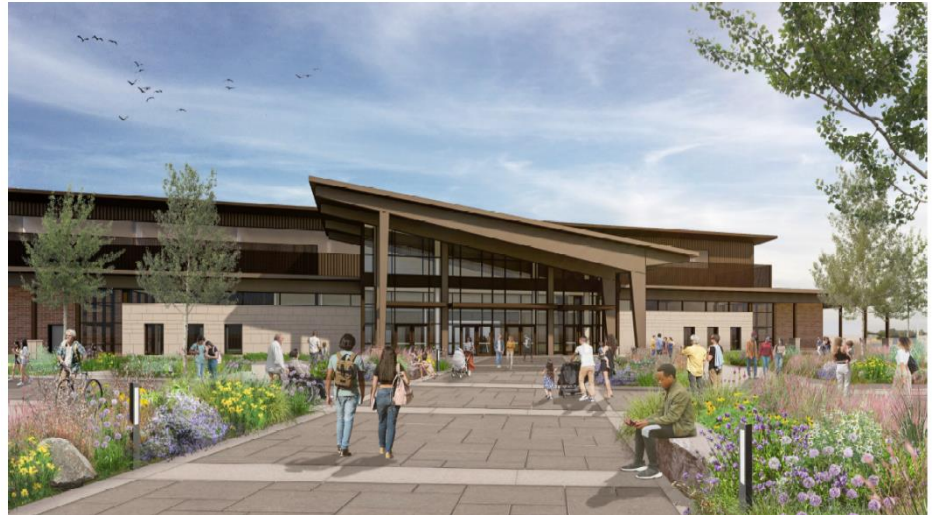
Rendering of Graham Park Regional Exhibition Center and outdoor site improvements.

Olmsted County requests a state sales tax exemption for construction materials, supplies, and equipment needed to construct the Graham Park Regional Exhibition Center and connected outdoor site improvements. The project will provide communities in the region more space for events and entertainment, bring in new tourists, and boost the regional economy.