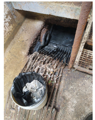
Aging bar screen with corrosion issues