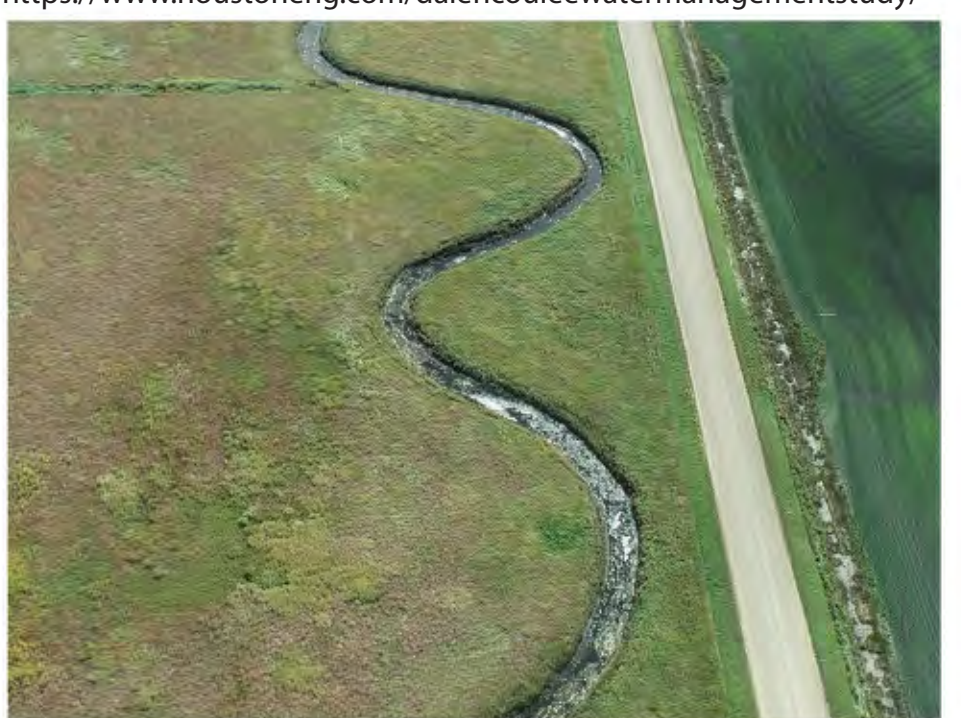
Investing in and Managing the Watershed of the Red River Basin

https://www.houstoneng.com/dalencouleewatermanagementstudy/