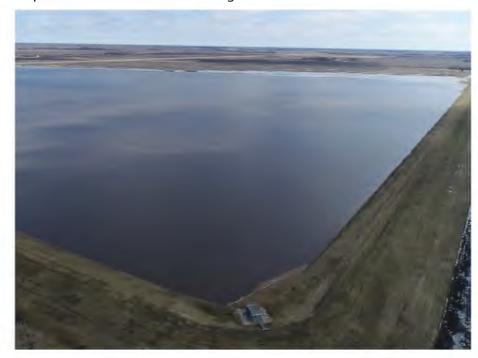
Redpath Impoundment and Mustinka River Rehabilitation Project

http://www.redlakewatershed.org/BlackRiver.html