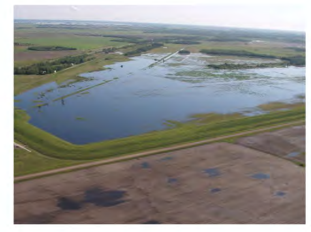
Dalen Coulee Project

http://tworiverswd.com/Ross_Impoundment.html