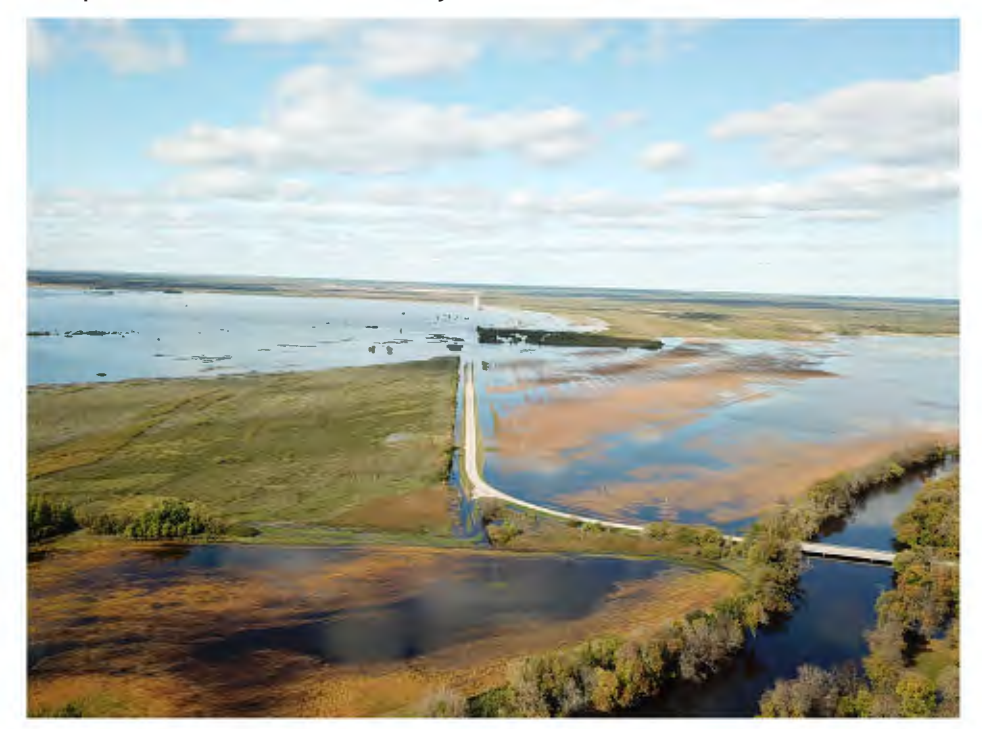
Agassiz Water Resource Management Project

http://roseauriverwd.com/Project_Roseau_Lake.html