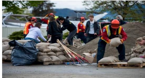
Disaster Mitigation & Resiliency