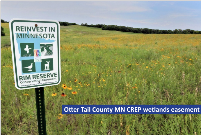
Otter Tail County MN CREP wetlands easement