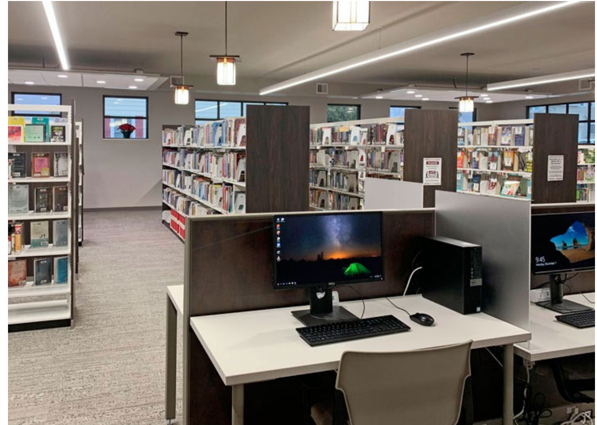
Kimball Public Library, 2019 grantee