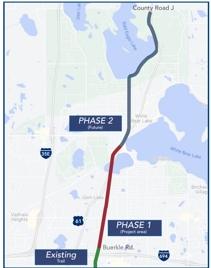
Bruce Vento Regional Trail Extension area - Buerkle Road