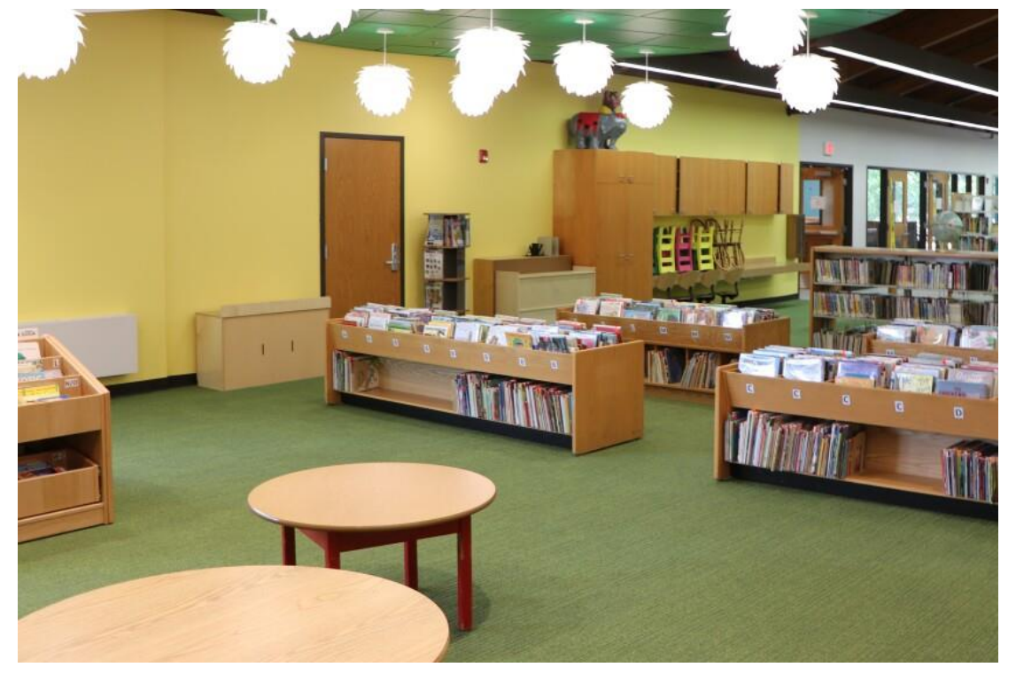
Cloquet Public Library, 2019 grantee