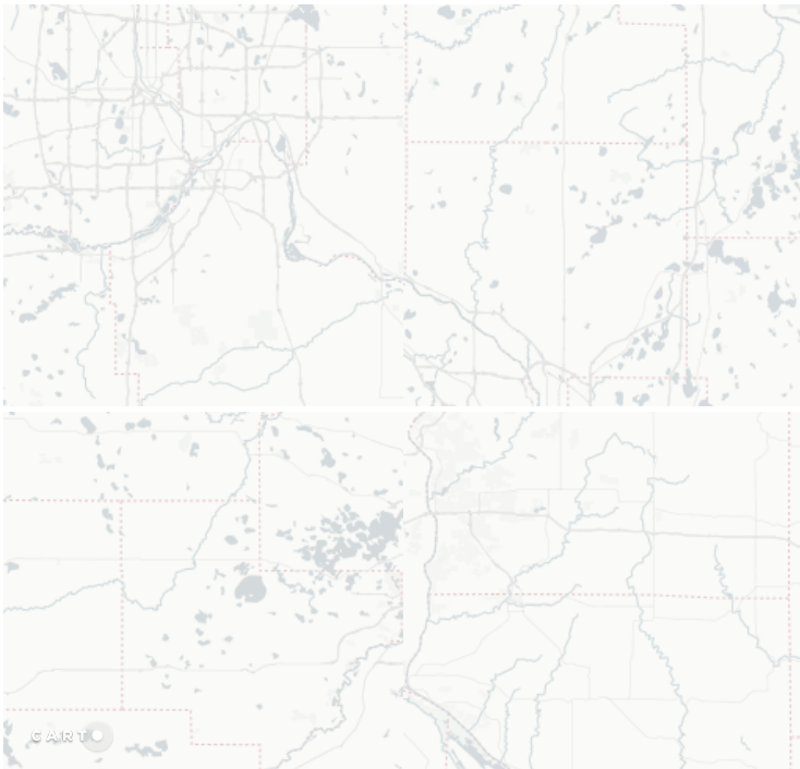
Map created by MaryJo Webster

Yet nearly every Twin Cities metro-area police department exhibits a racial disparity in its arrest rates, according to a Star Tribune analysis of recently released FBI Uniform Crime Reports data for serious crimes. Minneapolis, St. Paul and inner-ring suburbs had the highest disparities, which diminished in exurban areas.