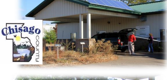
Cars lining up down the block to drop off!