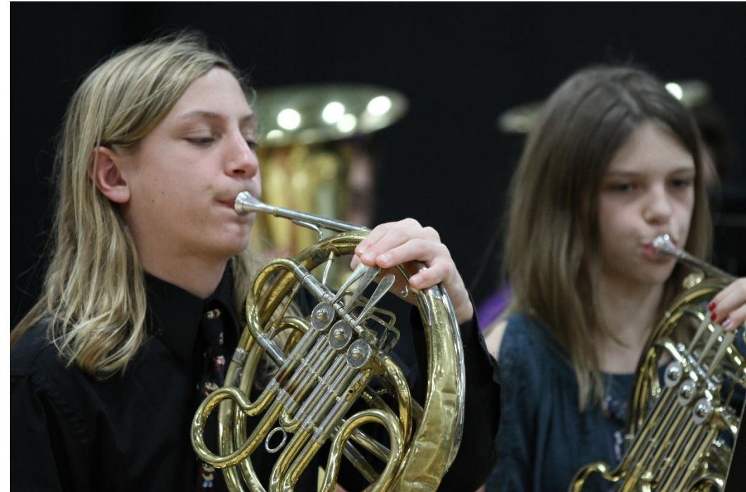
KSRQ (Thief River Falls) broadcasts school band and choir concerts.