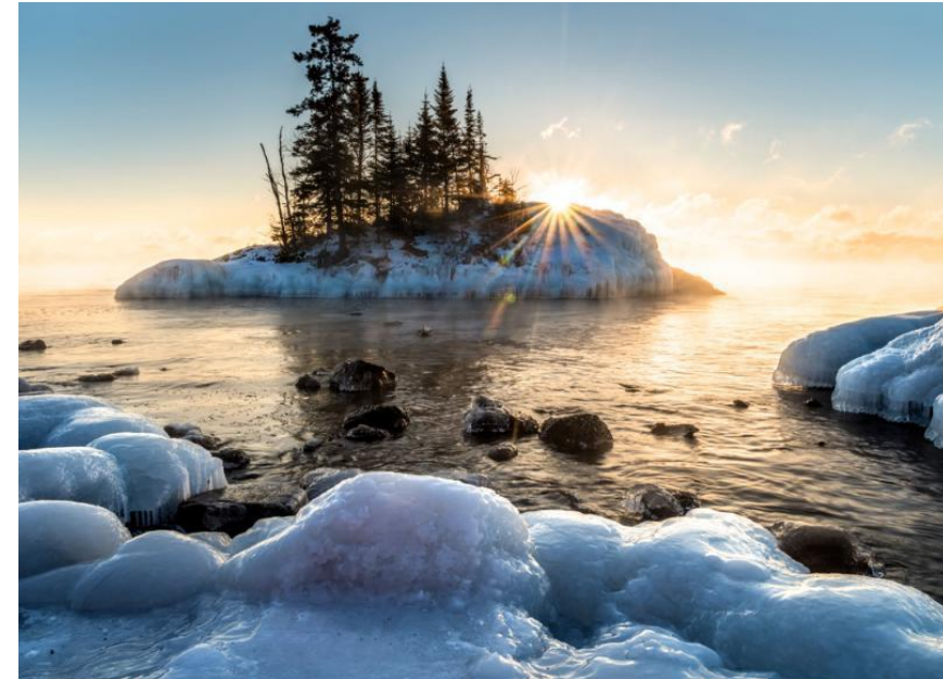
A winning entry from KBFT's Photo Contest in Bois Forte