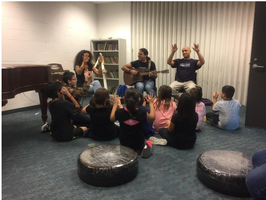
Performers in Bois Forte also went to the Boys and Girls Club