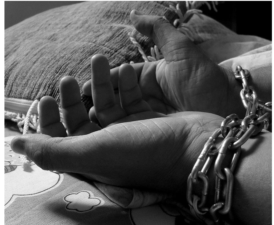
KMOJ's documentary "Sex Trafficking: The New Slavery" (Minneapolis/St. Paul)