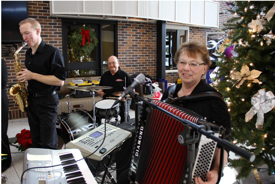
KSRQ's "Polkacast," a 24-hour streaming polka channel (Thief River Falls)