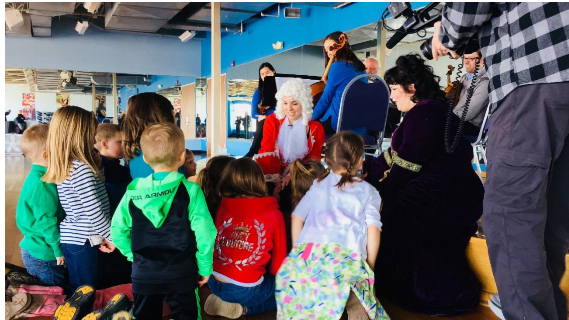
KMSU & Mankato Symphony Orchestra held a concert specifically for children