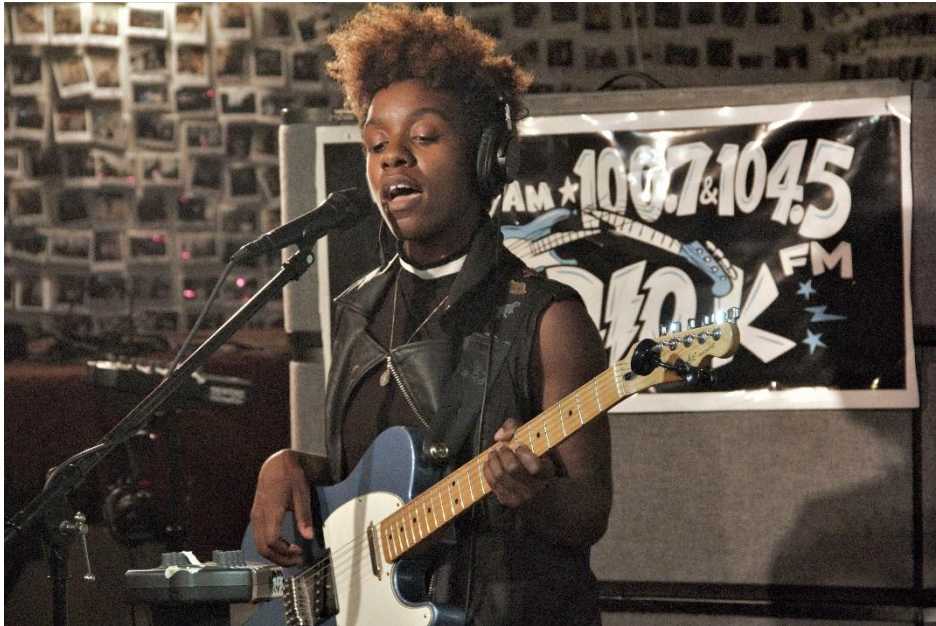
A Minnesota band performs live at Radio K (KUOM) in the Twin Cities