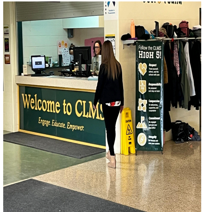
Check in desk - 42 feet from buzz in entry to CLMS