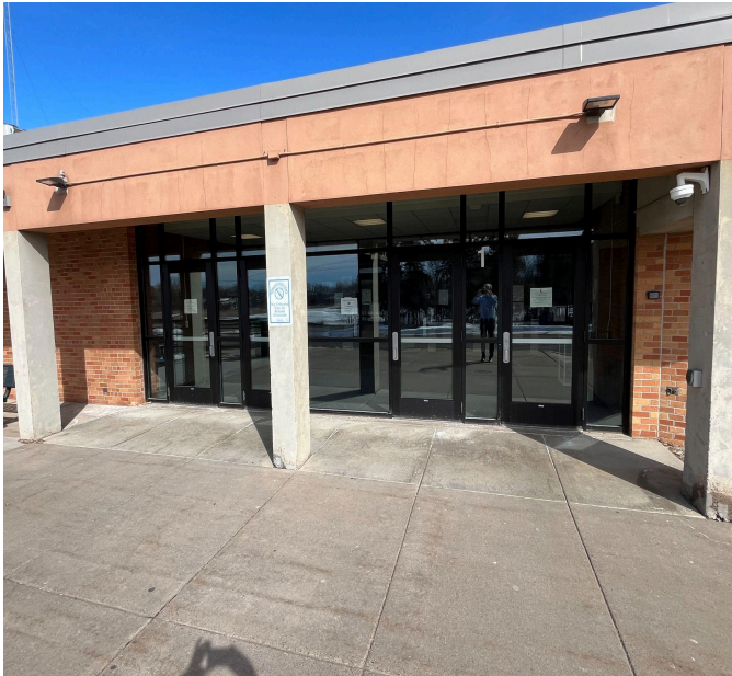
27 foot front entryway - 25 feet is glass