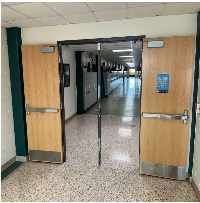
3rd floor - security doors at the end of hallway