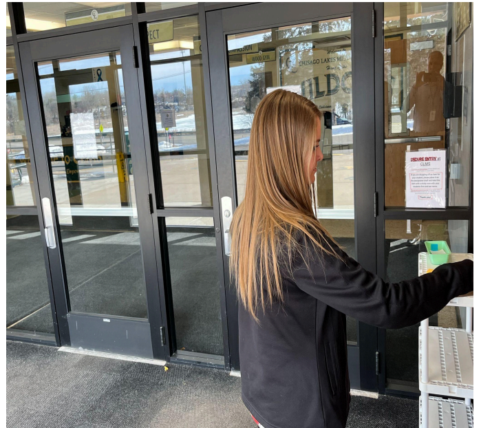
Security buzz-in entryway