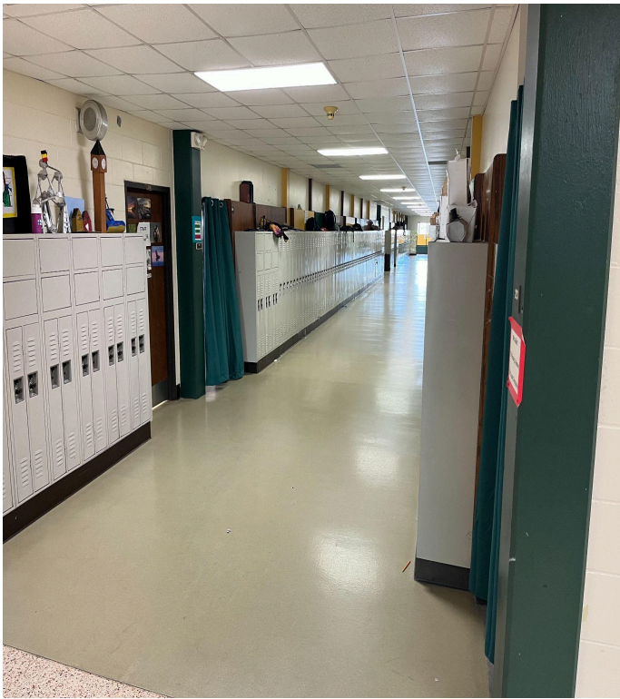
Third floor hallway