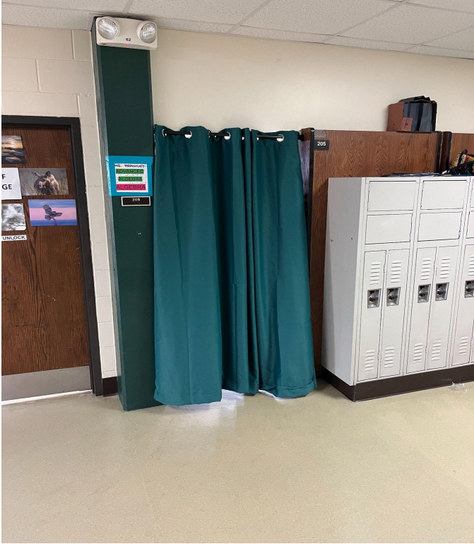
Third floor - "door entry" to classroom