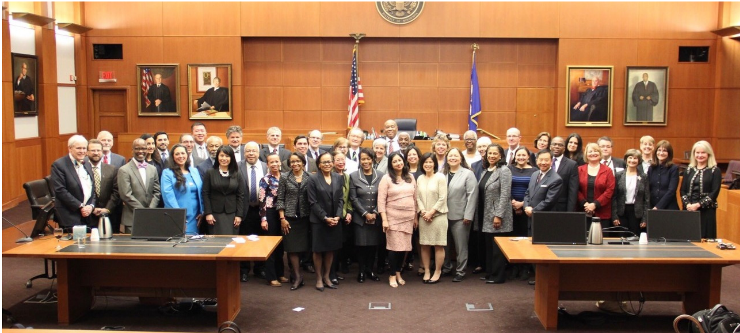
Minority Judges Reception March 2018